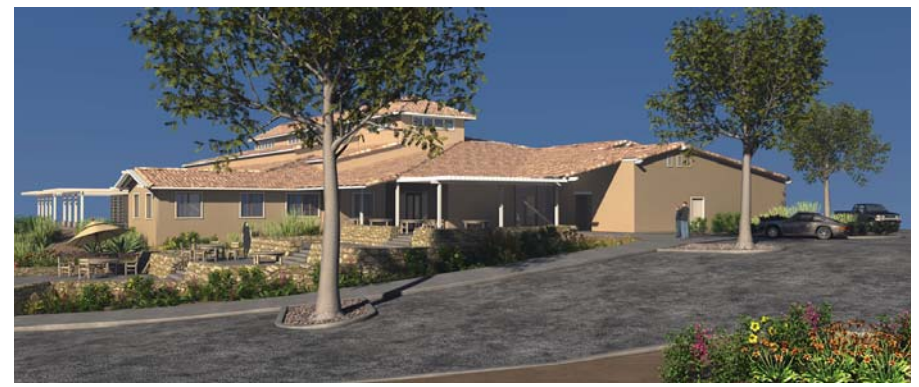
A rendering of the new tasting room and entrance shows what it should look like at completion.

what had been our conference room and my office. At the time, this was the only reasonable area for a tasting room within the current building. We didn't think at all that our second and third phases of construction were planned for the opposite side of the winery.