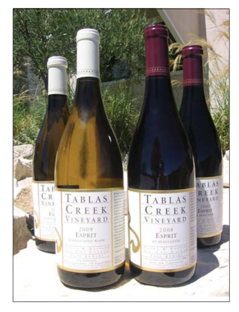
The new bottles in the foreground, old ones in the background.

When you first see the wines in the new bottle, let us know what you think. We hope that you'll agree that the bottle looks great. And we're very happy that we can share the wines we're so proud of in a package that is more consistent with our ethic. If you would like to read more about how we came to – and the consequences of – this decision, please visit the Tablas blog: http://tablascreek.typepad.com/tablas/2010/07/a-greener-wine-bottle.html