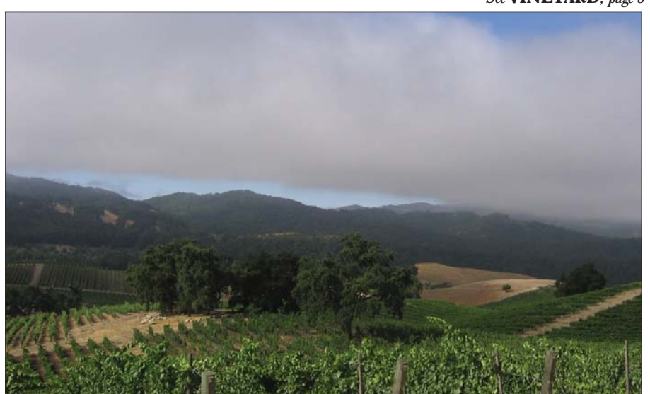
Fog over Tablas Creek on a July morning.