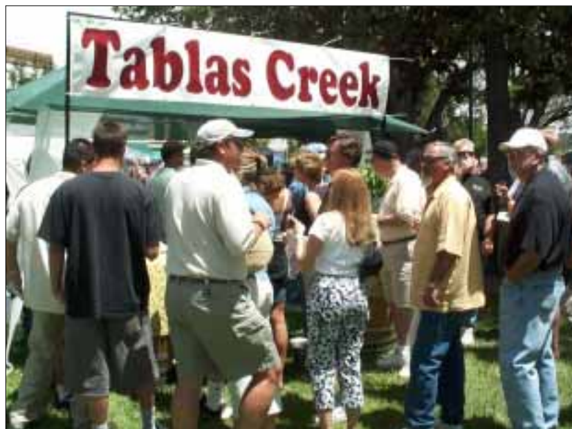
The Tablas Creek booth at the park on Wine Festival Saturday

Tablas Creek was one of 66 wineries represented in the park during the 21st Annual Paso Robles Wine Festival on May 17, and we poured the four wines in current release. The weekend also marked the release of the 2002 Rosé , especially for the Festival, and it was a perfect match for the hot sunny day. The tasting room was also busy, and we welcomed more than 750 people over the course of the Festival weekend.