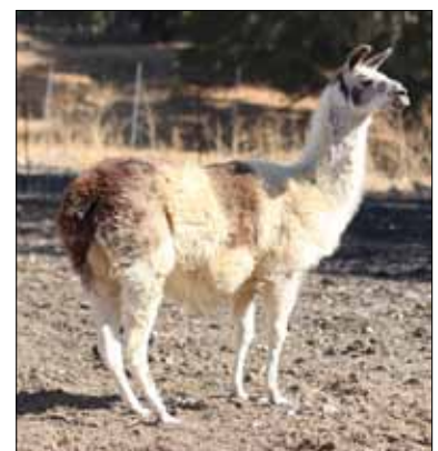
The newest member of our biodynamic family: Carmel the llama.

Finally, the harvest has been exciting because we've gotten to work with two grapes that are new to us, each celebrating their first harvest anywhere in America. We haven't yet learned much about Clairette Blanche or Terret Noir (except that the "noir" in Terret Noir is a bit of a misnomer) but we have a barrel of each fermenting in the cellar and it's going to be fun to see how they turn out.